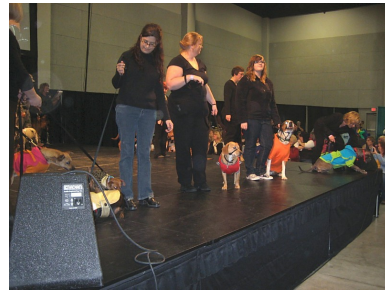
Volunteers and TAPS Dogs in Style Show at Women's Lifestyle Show

November 14th & 15th Peoria Petsmart 11-4- We will be taking adoptable dogs. Shifts will be 11-1:30 and 1:30-4:00 p.m. Any age can help.