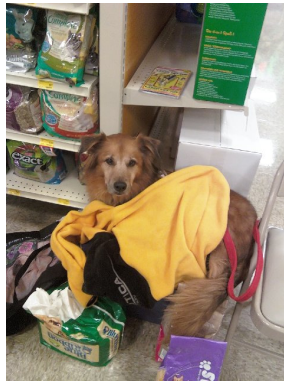
Scooby Doo at Petco Offsite

Scooby Doo is a 8 year old collie/shepherd mix that was brought to TAPS when his owner moved out and didn't take him with him. He can sit, walks nice on a leash and is well-behaved. He gets along with kids and some dogs but would need to be adopted by a family with no cats. He is looking for a new permanent home and a loving family.