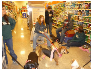
Volunteers and Dogs at Petsmart

February 12 th - E. Peoria Petsmart Adopt-a-thon 11:00-4:00p.m. We will be taking adoptable dogs and cats. Shifts will be 11-1:30 and 1:30-4.