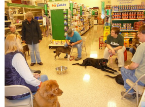
East Peoria Petsmart Adopt-a-thon February 2007

We started an early dog walking program in September . We still need volunteers to walk dogs at the shelter at 7 a.m. so they can get a potty break before breakfast. If you have time available (an hour is all we need) this early, please contact Sheila.